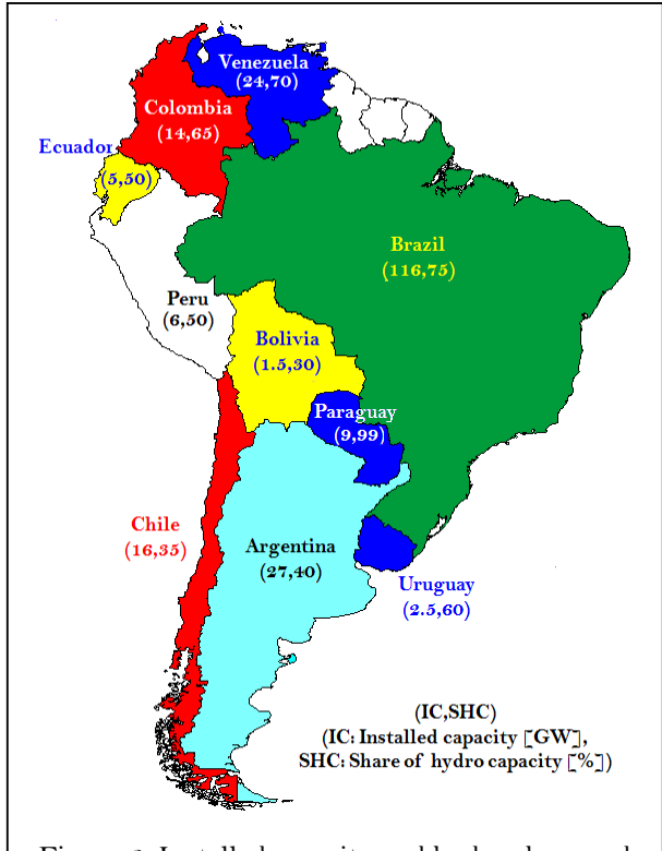
Figure 2. Installed capacity and hydro share and hydro potential in South American countries.

We already count on a very significant number of experiences and literature that can help us in assessing the efficiency of the different alternatives to promote RES. Nevertheless, many of the conclusions, particularly the ones extracted from the experiences in developed countries, cannot always be directly exported to the South American ones, since they differ not only due their electricity industry physical characteristics (clean energy matrices with predominance of hydropower, and still a significant amount of untapped large hydro potential) but also to their regulatory characteristics - any of the countries has yet entered into any international climate change commitment and for instance most countries' regulatory framework has somehow returned to regulator-driven long-term contracting, see Batlle et al. (2010)- and to their specific socio-economic environment (country risk is still a big issue, financing is limited and the